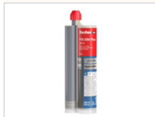
FIS EM PLUS 390/585 S