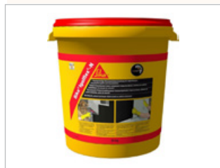
Sika® igolflex®-121 in/ Davco K10 Damp Flex