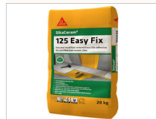
Sika Ceram -125 Easy Fix