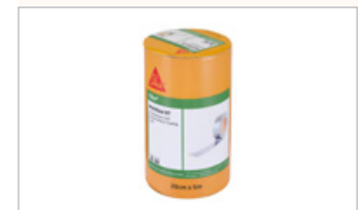
Sika Seal Tape BT