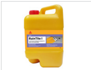
Sika® Raintite I