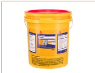
Sika Latex Super