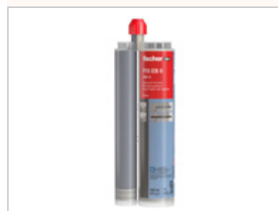
FIS EB II 390/585 S