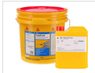
Sika Cool Coat