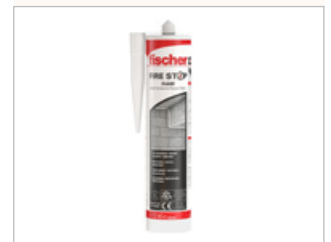
Intumescent Acoustic Mastic FiAM