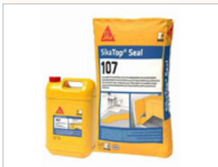
Sika Top Seal 107