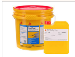
Sikalastic 510/ Davco K10 Sovacryl