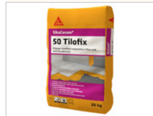
Sika Ceram - 50 Tilofix