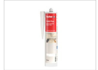
Acoustic Mastic FiAM Plus