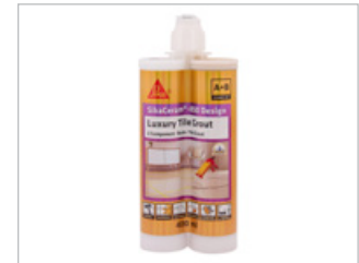
Sika Tile Grout -850