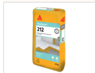
Sika Ceram - 212