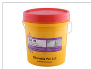
Sikalastic 562 / Davco K10 PU Plus