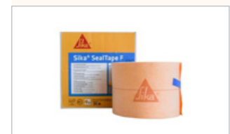
Sika Seal Tape F