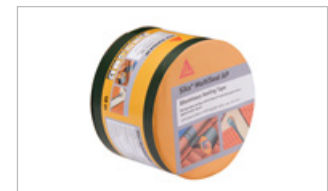
Sika Seal Tape AP