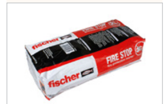
Rapid Fire Seal RFS 640