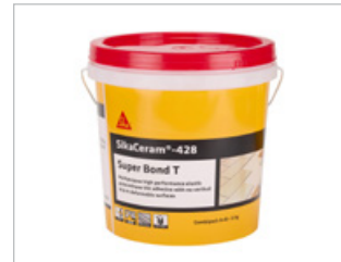
Sika Ceram - 428