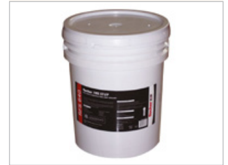
Rapid Fire Seal RFS 640