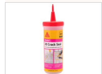
Sikadur - 20 Crack Seal