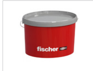
FIS V Plus 360 S in bucket