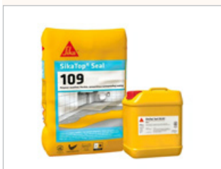
Sika Top Seal 109