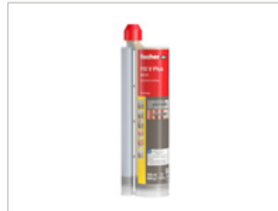
FIS V PLUS 360 S