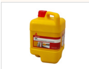
Sika Latex SBR