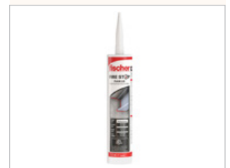
Intumescent Acoustic Mastic FiAM US